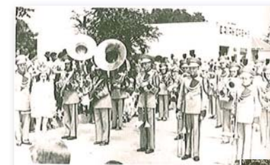
Pictured Right: 1954 - Area family appears in full ceremonial dress for Fish Days